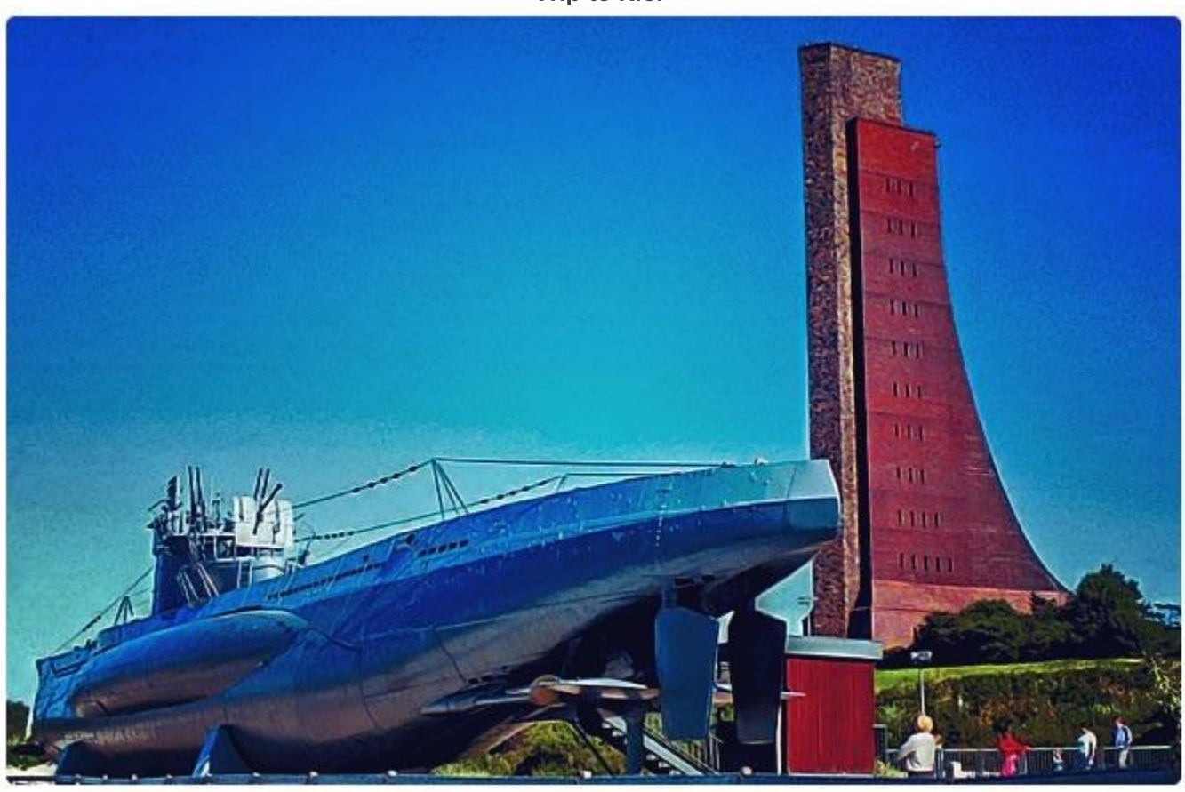
Day 5, Thursday, June 20 Trip to Kiel

Today we take train to Kiel. Kiel is the capital and most populous city in the state of Schleswig Holstein. This city is one of the major maritime centers of Germany and is know for a variety of international sailing events, including the Kieler Woche, (Kiel Week) which is the biggest sailing event in the world. From the train station we walk over to the ferry which will bring us to the Laboe Naval Memorial. It is dedicated to the sailors of all nationalities who were lost at sea. The 236 ft tower gives you a great look over the city and bay. We will also see the German submarine U-995 the world's only remaining Type VII U-boat.