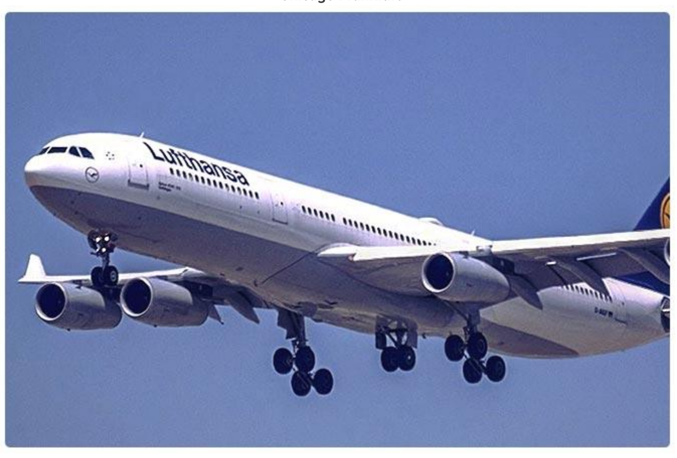
Day 1, Sunday, June 16 Chicago-Frankfurt

We are leaving Chicago late afternoon on your non-stop flight to Frankfurt. Cocktails and dinner will be served en route.