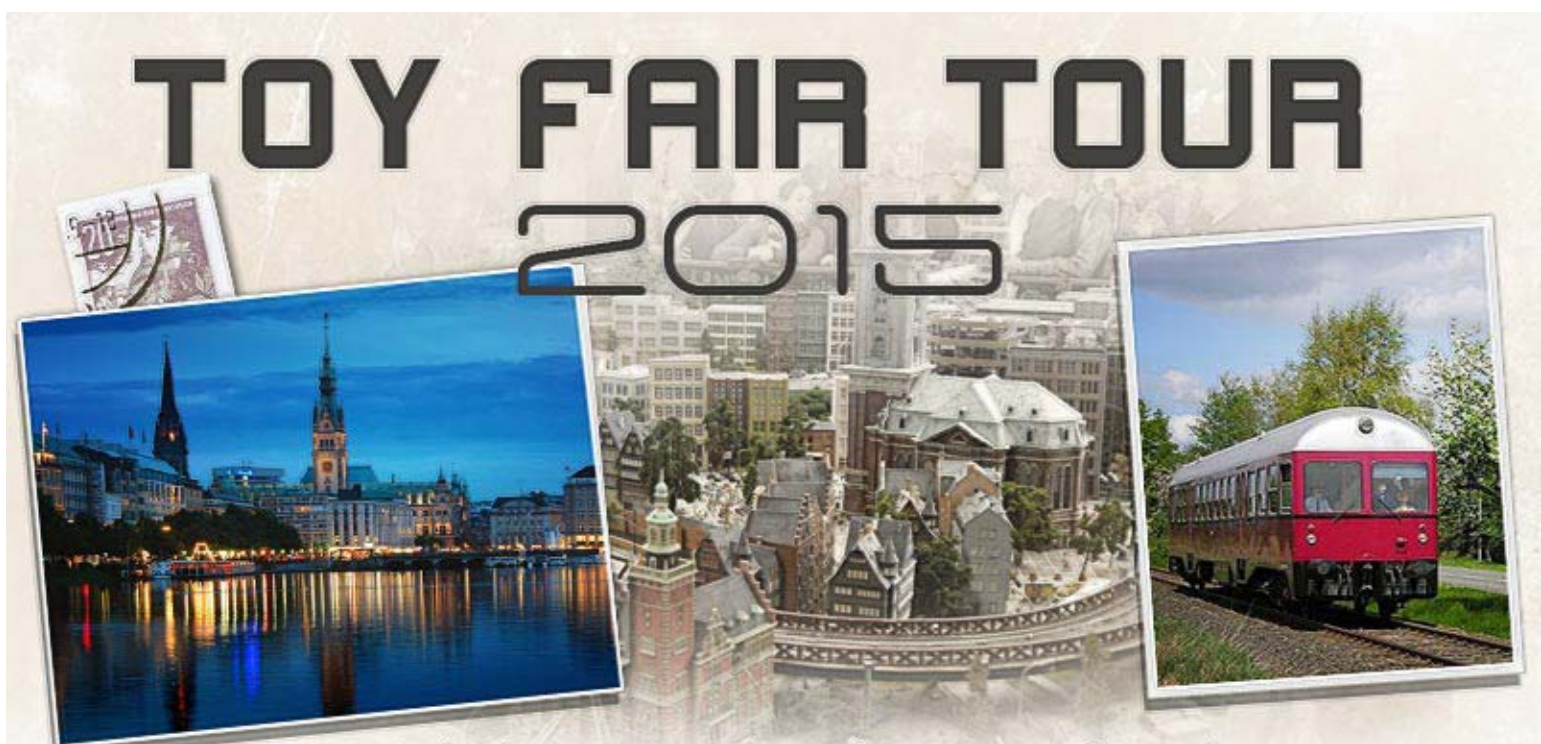
We invite you to join us for a tour of Hamburg, Lüneburg, Bleckede, Leipzig and Nürnberg.